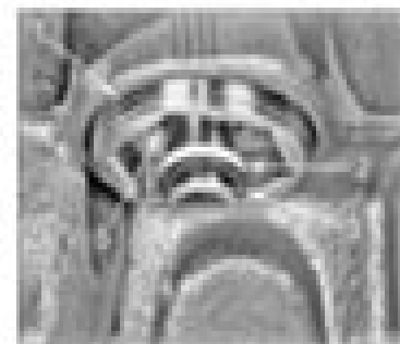
Figure 262 Injector oil inlet adapter installed in high-pressure oil manifold