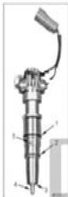
Figure 261 Fuel injector assembly

NOTE: If nozzle gasket is missing from any injector removed, look for gasket at bottom of its injector bore. Remove and discard all nozzle gaskets.