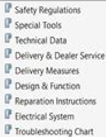
Circuit diagram Rider 13 and Rider 13 Bio