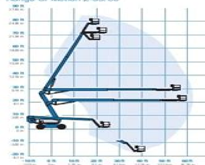
Range Of Motion Z-80/60

Standards Compliance -ANSI A92.5, CSA B354.4, EN 280, AS 1418.10