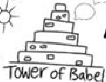
Tower of Babel