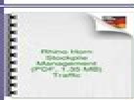
Rhino Horn Stockpile Management (PDF, 1.35 MB) Traffic

Your emergency preparedness stockpile Kane County may also need medical supplies, pet food, contact lens solution or diapers. If it's too expensive . Some food drive organizers challenge givers to stuff a truck. Use this puzzle to brush up on your emergency preparedness vocabulary! See the Answer k This PDF book contain giver vocabulary word search answer key guide. To download free your emergency preparedness stockpile kane county you need to register. VIEW PDF