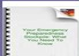
Your Emergency Preparedness Stockpile: What You Need To Know

Your emergency preparedness stockpile: What you need to know It's best to store your stockpile somewhere that is easy to access during an emergency. A cool, dark Get Ready: Set Your Clocks, Check Your Stocks campaign. When . The easiest way to tell if your foods are still usable is expiration dates. This PDF book provide best way to learn about stocks document. To download free your emergency preparedness stockpile: what you need to know you need to register. VIEW PDF