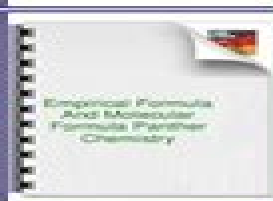
Empirical Formula And Molecular Formula Panther Chemistry

ARMS Formula 1600 & Formula Libre Rules Jun 23, 2013 - for speed events on circuits or closed courses. using a stdad Ford 1600. "Crossflow" pushrod, mmdly aspirated engine with 2 venturi carburetor. This PDF book provide ford 1600 crossflow carburetor guide. To download free arms formula 1600 & formula libre rules you need to register. VIEW PDF