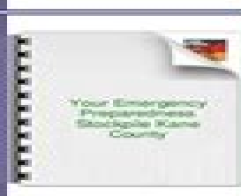
Your Emergency Preparedness Stockpile Kane County

Your emergency preparedness stockpile: What you need to know It's best to store your stockpile somewhere that is easy to access during an emergency. A cool, dark Get Ready: Set Your Clocks, Check Your Stocks campaign. When . The easiest way to tell if your foods are still usable is expiration dates. This PDF book provide best way to learn about stocks document. To download free your emergency preparedness stockpile: what you need to know you need to register. VIEW PDF