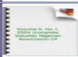
Volume 5, No.1, 2004 (complete Volume) Nigerian Association Of

Empirical Formula and Molecular Formula Panther Chemistry HSPI The POGIL Project. Limited Use by Permission Model 1: Comparison of Percent Composition and Empirical Formula. Substance Compound. Name. This PDF book contain percentage composition empirical formula pogil guide. To download free empirical formula and molecular formula panther chemistry you need to register. VIEW PDF