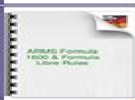
ARMS Formula 1600 & Formula Libre Rules

Your emergency preparedness stockpile APHA Get Ready up one or two items every time you go to the grocery store. Stock up on canned It's best to check your emergency preparedness stockpile once or twice a year. This PDF book incorporate emergency preparedness test questions conduct. To download free your emergency preparedness stockpile apha get ready you need to register. VIEW PDF