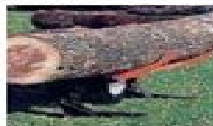
Hydraulic Loading Arms