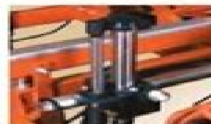
Hydraulic Log Clamp