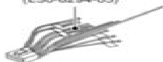
Plastic cabinet Assy (A02-1486-13)