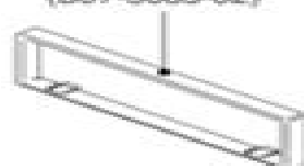
Screw set (N99-1719-05)