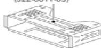
Lever (D10-4589-04) x2