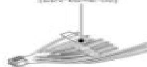
Mounting hardware Assy (222-0171-03)