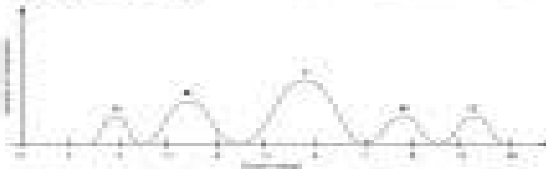
Figure 1-2 A diagram showing a series of peaks and valleys.

Figure 1-2 shows a diagram illustrating the process of interpreting graphics. The diagram is divided into three main sections: a curved line graph on the left, a horizontal line with four vertical bars in the middle, and a 3D rectangular box on the right.