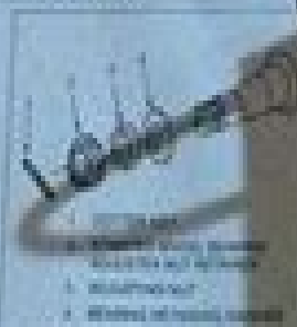
Figure 4.24 - Stamped Adjuster Nut Bearing Type

The Coneset nut is secured with a roller key through the tapered portion of the nut and one of the two holes drilled in the axle. If the roller key does not align with the hole in the tapered roller, loosen or retighten, back off the nut to the full position or until the roller key can be inserted.