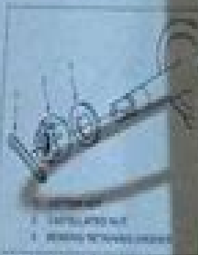
Figure 4.25 - Coneset Nut Type