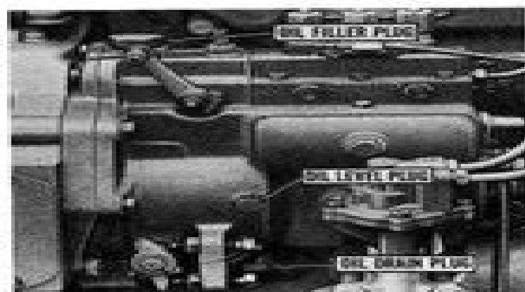
Fig. F0521 — Lubricating oil must be maintained at proper level and be changed at regular intervals on mechanical governor type fuel injection pumps. Drain, fill and oil level plug locations are shown. Refer to paragraph 29.