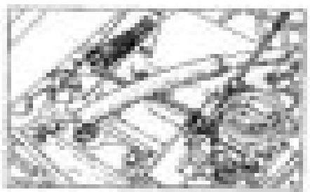
Figure 4. Engine and air filter housing.