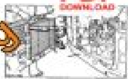
Figure 2. Engine and air filter housing.