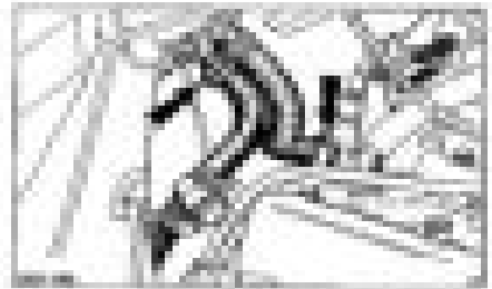
Figure 3. Engine and air filter housing.