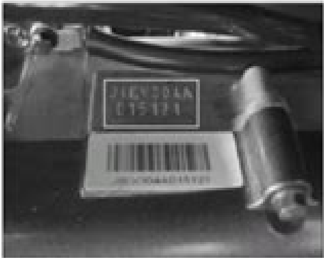
Engine serial number