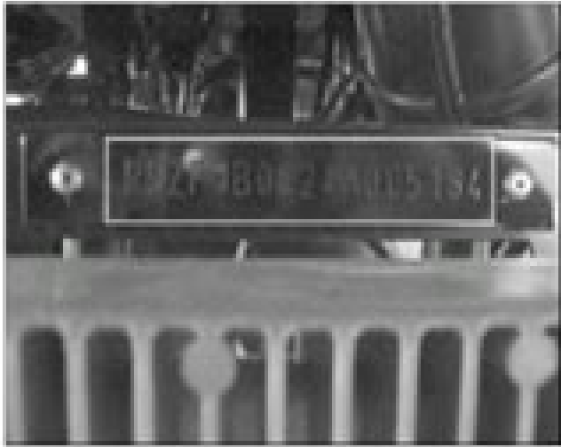
Frame serial number