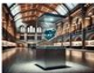
The Star of Azura in the National History Museum