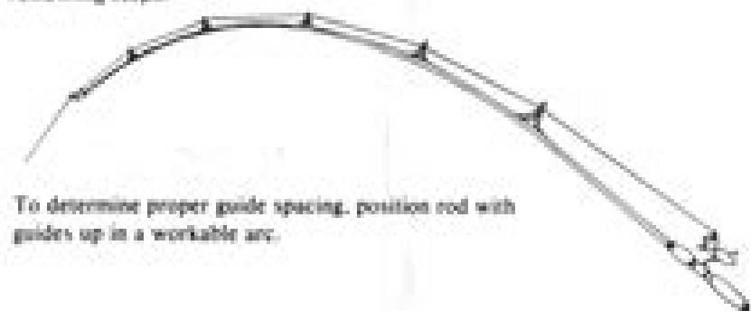
To determine proper guide spacing, position rod with guides up in a workable arc.

the line slap is eliminated and you are attaining maximum casting distance. On fly rods adjust the position of the butt guide to where the line "shoots" most comfortably without slapping against the blank. On any rod you have determined the correct position of the butt guide when the rod casts the greatest distance. It should not be moved again in the following steps.