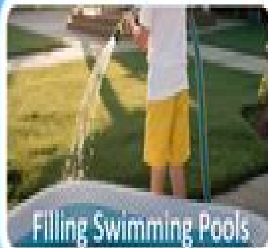
Filling Swimming Pools