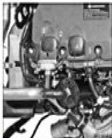
Figure 490 Breather tube and valve cover adapter