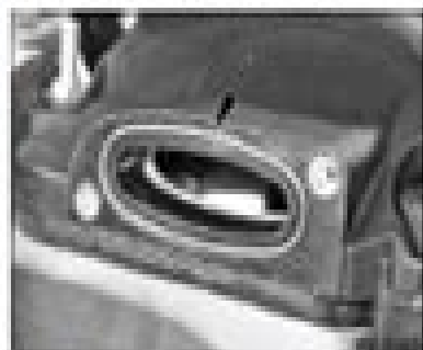
Figure 489 Valve cover adapter O-ring