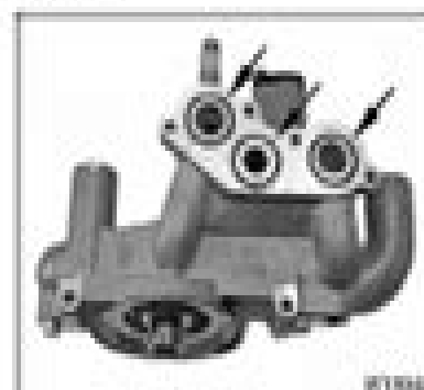
Figure 491 Oil filter base assembly O-rings

⚠ CAUTION: To prevent personal injury or death, contain and dispose of engine fluids in a proper container according to applicable regulations.