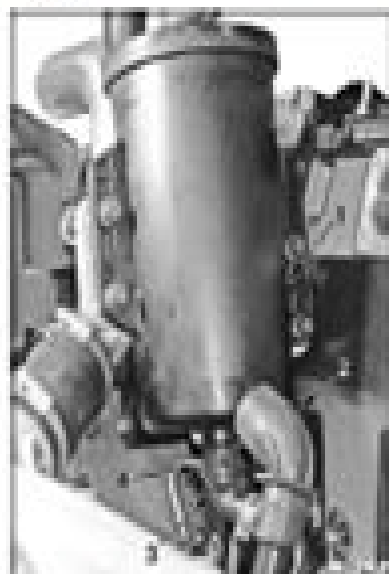
Figure 488 Tube connections at breather filter assembly