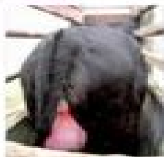
Distension stage of calving. The cow is showing signs of distress, with the vulva being red and swollen.