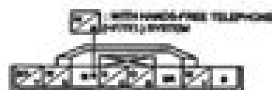
0920-301 CRUISE CONTROL SWITCH / STEERING SWITCH ILLUMINATION / CRUISE CONTROL SWITCH ILLUMINATION / STEERING SWITCH / CLOCK SPRING