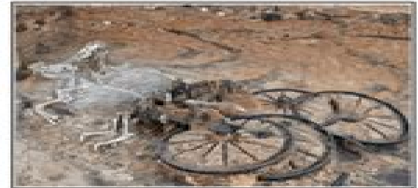
Source 3 An Iron Age chariot found buried with a person in Yorkshire, England

a. Choose one of the sources and describe what we could learn about life in Britain during the Iron Age. (2 marks)