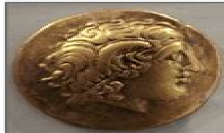
Source 2 A gold coin from the 5th to the 1st century BCE in Gaul (covered mainland Western Europe), found in England