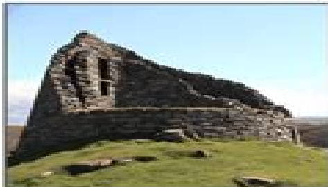
Source 1 A broch in Lewis, Scotland

5. Sources 1, 2 and 3 are about the Iron Age. Study them carefully and then answer the following questions. (6 marks)