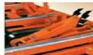
Hydraulic Log Turner