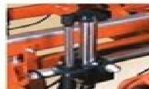
Hydraulic Log Clamp