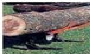
Hydraulic Loading Arms