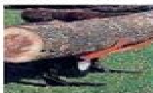
Hydraulic Loading Arms