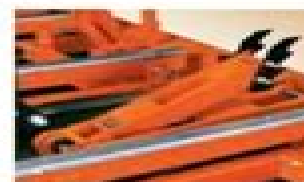
Hydraulic Log Turner