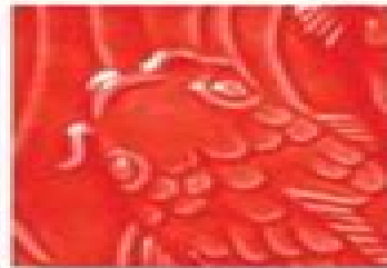
LG-59 [TL] Hot Red