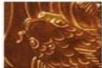
LG-36 [O] Freckled Brown