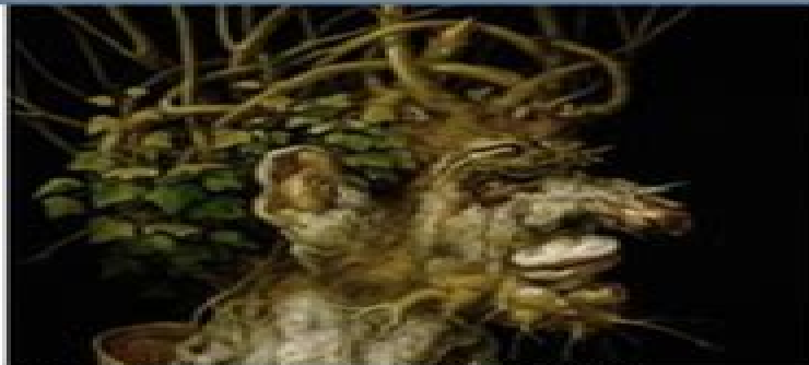
- « L'hiver » peint vers 1562 par Arcimboldo