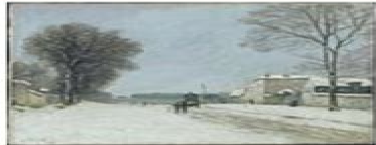
- EN HIVER EFFET DE NEIGE - peint au 4e quart 19e siècle par Alfred Sisley

Quelques maisons de chaume épaulent la ligne d'horizon et se pressent autour du clocher juste central. (Le haut du cadre coupe la pointe trop aiguë de la flèche.) A gauche, une falaise violette tombe vers un crépuscule. A droite filent des arbres maigres. Tout le sol est fait de neige, ruisselant de lumières fondues, magnifique pelage bleu et rose, fourrure sur le sol froid.