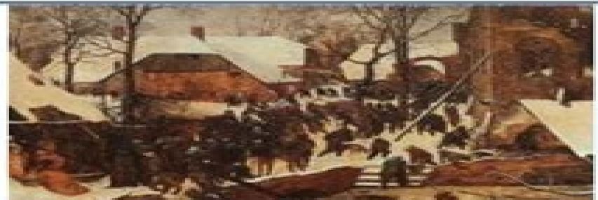
- « L'adoration des mages dans un paysage d'hiver » de Pieter Bruegel 1567

Bien qu'on ait prêté peu d'attention à l'œuvre d'Alfred Sisley de son vivant, son importance est aujourd'hui reconnue