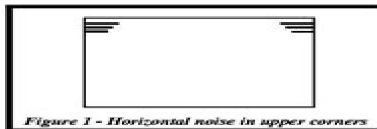
Figure 1 - Horizontal noise in upper corners

Details: If a symptom such as shown in Figure 1 appears, (more visible in brighter scenes), check the Deflection PWB to see if location K025 has been replaced by a coil. If there is still a jumper in place, replace it with a 47 \mu h coil, p/n BH01889R. See Figures 2 and 3 for location.