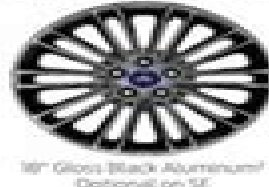
16" Gloss Black Aluminum† Optional on SE