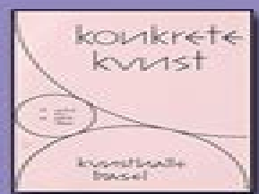
konkrete kunst (1944)