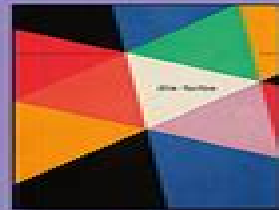
die farbe (1944)