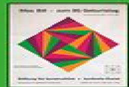
50 ans de Max Bill (1985)