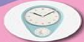
Horloge de cuisine

Max Bill se conçoit avant tout comme un théoricien de la forme et envisage une approche mathématique de l'art. Il refuse de « prendre appui sur la nature sensible ou sur la transformation de celle-ci ». Il veut intégrer l'art à l'environnement. Ses peintures, ses sculptures sont des structures géométriques. Tout au long de son œuvre, il réalise « des continuités de variations sur un même thème » : bande de Möbius, carrés, sphères ou cylindres. En 1936, il pose l'art concret : « Concret est le contraire d'abstrait : l'art figuratif est abstrait de la réalité, tandis que l'art non-figuratif, qui est une pure création de l'esprit, devient concret par sa matérialisation, comme une chose existant dans la réalité ». Dès le début des années quarante, il aborde la recherche picturale sur le carré et les autres figures géométriques. A partir des années cinquante, il est attributaire de nombreuses commandes publiques et réalise ponts, pavillons, mobilier ou structures urbaines et jardins suivant les lois de l'Art concret qu'il voit comme « l'expression pure de la mesure et de lois harmonieuses ».