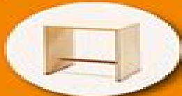
Ulmer Hocker (1954)