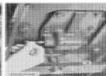
(3) Link Fulcrum Shaft Gear