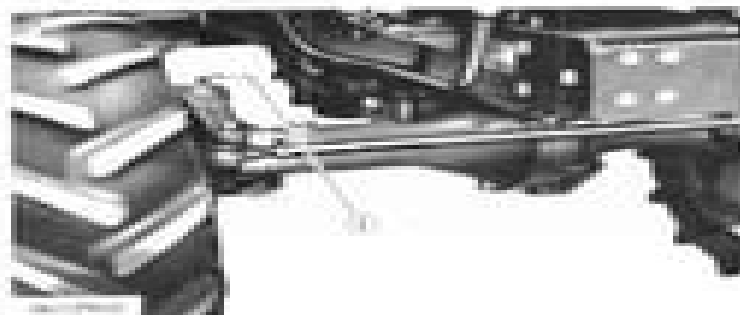
1. Grease Gun

Grease the kingspin and center pin, with the provided grease gun.