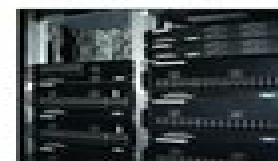
Slim profile for rack mounting