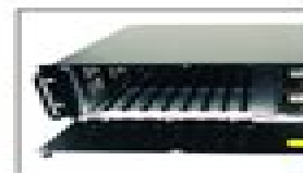
Eight slots for plug-in, hot-swappable port processors

As technology moves faster and faster, the MegaNAC 180 plays a strategic role in the Hypercom framework. Network owners know they can freely evolve from one technology to another with the assurance that yesterday's systems will seamlessly integrate into tomorrow's newest offerings.