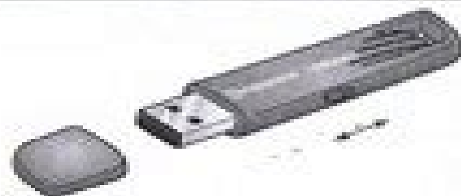
Right position – write protected Left position – not write protected