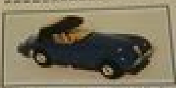
1940 Dodge 100 convertible

Color: Black, Blue, Dark Green, Light Green, Maroon, Grey, Green, Lavender, Light Red, Wine Red, Tan, White and Ivory White. Notes: This car is extremely well equipped and is available in many colors. The body is painted black and the top is painted black. The car is very well equipped and is available in many colors. Value: Lower $45, Dark $45.