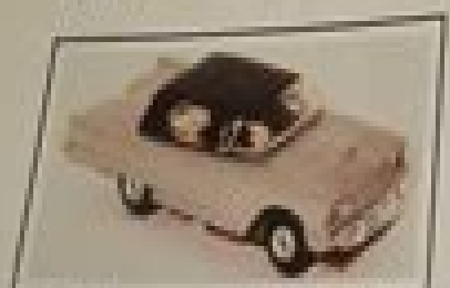
1940 Packard Sedan

Color: Black, Blue, Dark Green, Light Green, Maroon, Grey, Green, Lavender, Light Red, Wine Red, Tan, White and Ivory White. Notes: The windshield is extremely strong and is available in many colors. The body is painted black and the top is painted black. The car is very well equipped and is available in many colors. Value: Lower $45, Dark $45.