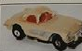
1940 Corvette convertible

Color: Black, Blue, Dark Green, Light Green, Maroon, Grey, Green, Lavender, Light Red, Wine Red, Tan, White and Ivory White. Notes: The car is extremely well equipped and is available in many colors. The body is painted black and the top is painted black. The car is very well equipped and is available in many colors. Value: Lower $45, Dark $45.