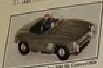
1940 Mercedes 200 SL convertible

Color: Black, Blue, Dark Green, Light Green, Maroon, Grey, Green, Lavender, Light Red, Wine Red, Tan, White and Ivory White. Notes: This car is extremely well equipped and is available in many colors. The body is painted black and the top is painted black. Value: Lower $45, Dark $45.