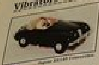
1940 Dodge 100 convertible

Color: Black, Blue, Dark Green, Light Green, Maroon, Grey, Green, Lavender, Light Red, Wine Red, Tan, White and Ivory White. Notes: This car is extremely well equipped and is available in many colors. The body is painted black and the top is painted black. Value: Lower $45, Dark $45.