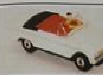
1940 Packard Sedan

Color: Black, Blue, Dark Green, Light Green, Maroon, Grey, Green, Lavender, Light Red, Wine Red, Tan, White and Ivory White. Notes: The car is extremely well equipped and is available in many colors. The body is painted black and the top is painted black. The car is very well equipped and is available in many colors. Value: Lower $45, Dark $45.