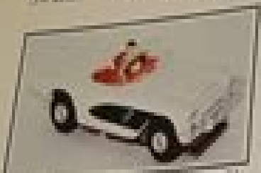
1940 Corvette convertible

Color: Black, Blue, Dark Green, Light Green, Maroon, Grey, Green, Lavender, Light Red, Wine Red, Tan, White and Ivory White. Notes: The automobile is very well equipped and is available in many colors. The body is painted black and the top is painted black. The car is very well equipped and is available in many colors. Value: White $75, Dark $45.