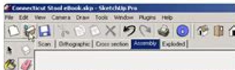
Figure 5. The horizontal toolbars let you change the point of view of the drawing, alter the style of the faces in a model, and perform such basic functions as cut, copy, paste, and print.

When designing a piece of furniture, you often have to connect components precisely. So as you move one component into position, you zoom in to be sure you're making the right connection. And you may need to orbit the model to get a better view. These viewing actions can be done while the Move/Copy Tool is still activated. You can go back and forth quickly between changing the view and moving the component.