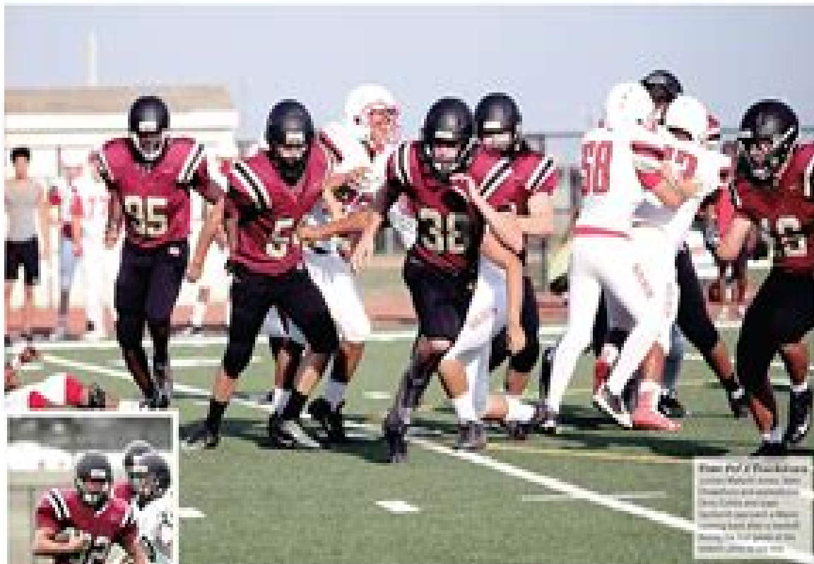
From left: Freshmen running back, sophomore running back, and sophomore running back. Freshmen running back, sophomore running back, and sophomore running back.

Freshmen and JV Football Teams Go Head-to-Head Against Opponents for Victory