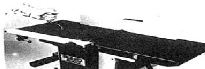
Handkurbel wird durch die Bohrung des Abgabetisches gesteckt.

1.1. With the new version the thicknes- sing table is not adjusted via the tooth belt but via a chain. The handle for height adjustment is not anymore at the side of the ma- chine.