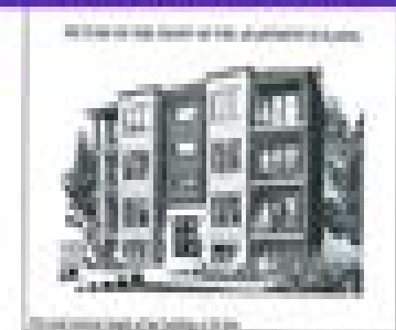
FIGURE 1: A school building with a garden and a playground.

FIGURE 2: A school building with a garden and a playground.