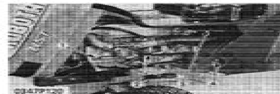
(6) 1P Connector