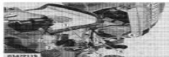
(2) Positive Cable