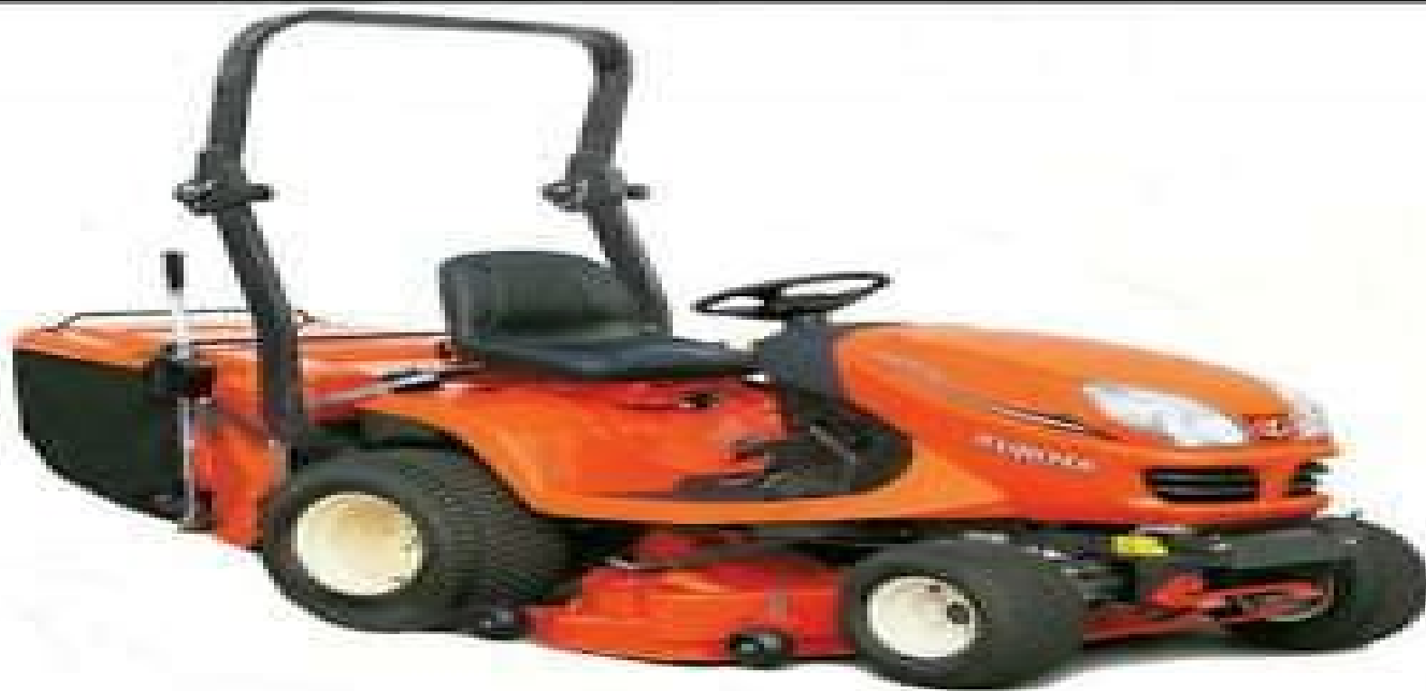
KUBOTA GR2120 RIDE ON MOWER