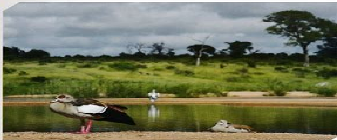
The tranquil setting of a dam with Egyptian Geese in foreground

There is accommodation for the disabled at all restcamps. Day visitor areas include toilets, shade, seating and braais.