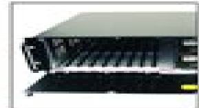
Eight slots for plug-in, hot-swappable port processors

As technology moves faster and faster, the MegaNAC 180 plays a strategic role in the Hypercom framework. Network owners know they can freely evolve from one technology to another with the assurance that yesterday's systems will seamlessly integrate into tomorrow's newest offerings.