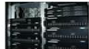
Slim profile for rack mounting