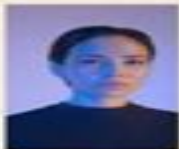
Elduin The Fire Mage