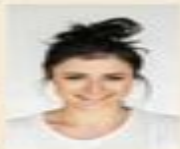
Lunaria The Spell Weaver