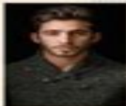
Elemental The Summoner