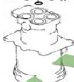
センタージョイント CENTER JOINT