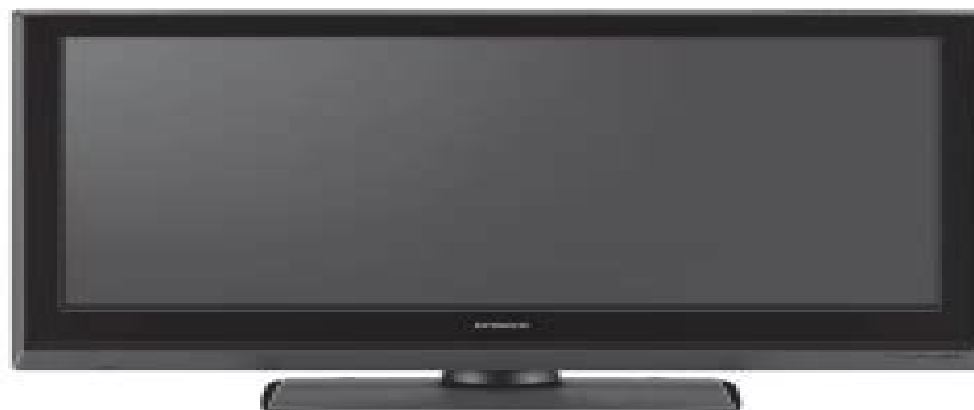
This is the image of the model L37X01U.

Die in diesem Wartungshandbuch enthaltenen Spezialisationen können sich zwecks Verbesserungen ändern.