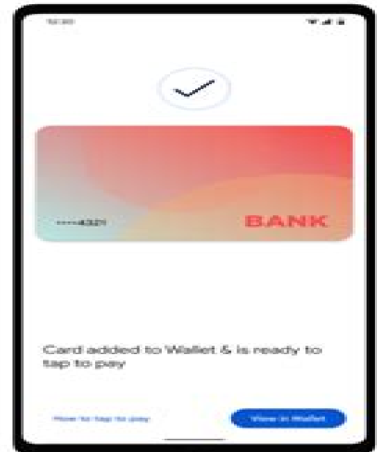
6. Success screen