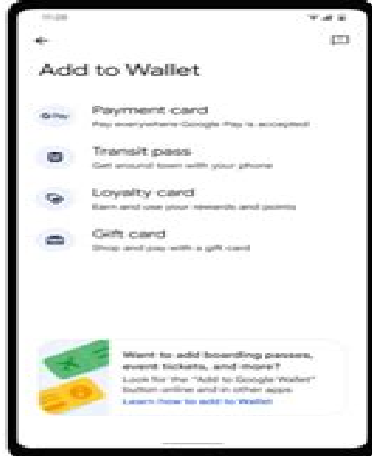
1. Start adding a card