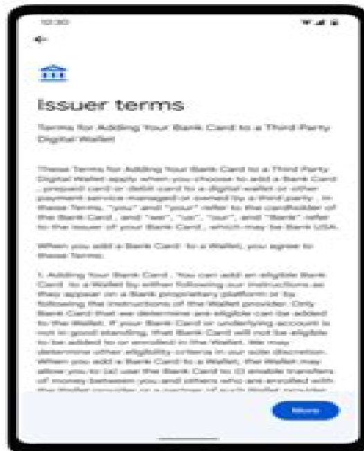
4. Accept issuer ToS