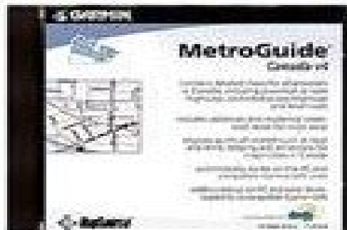
Mapsource MetroGuide Canada