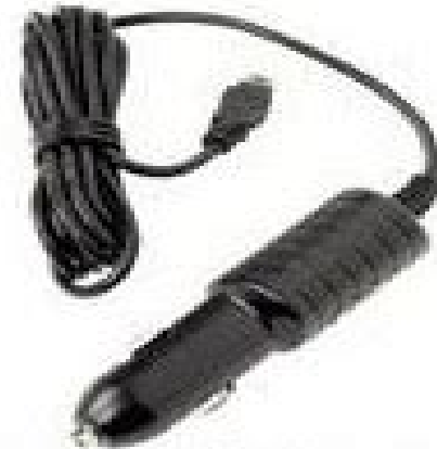
vehicle power cable