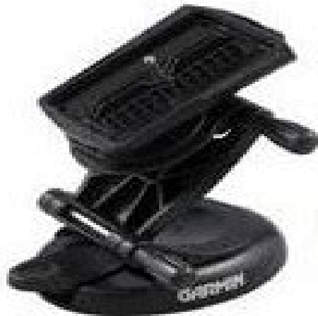
automotive dash mount