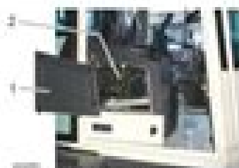
Fig. 386 Fuses in the driver's cab