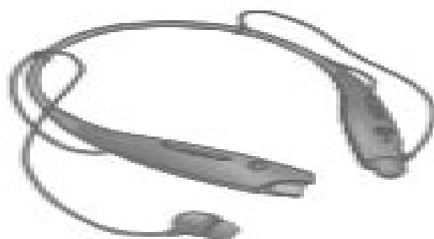
LG | TONE™ HBS-700