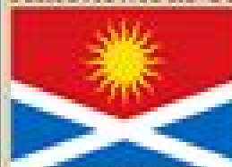
Dominion of Darien