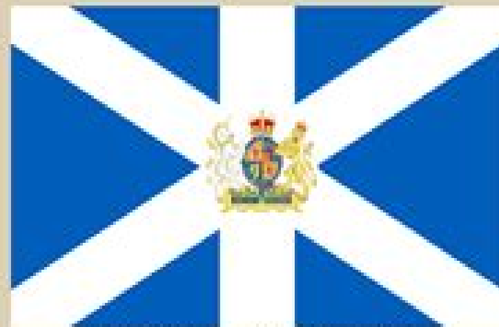
Kingdom of Scotland Rìoghachd na h-Alba Regnum Scotiae