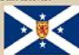
Nova Scotian Dominion