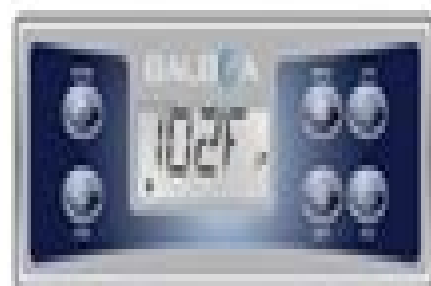
Balboa VL200 / VL400