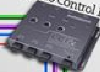
Audio Control LC6i